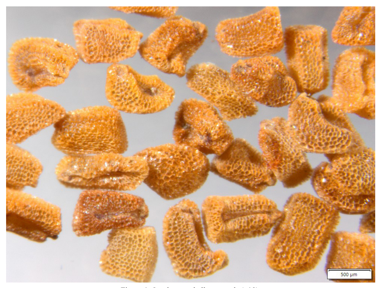
Figure 1. Isoplexis isabelliana seeds (x10).

Isoplexis isabelliana flowers from June to September and fruits in September and October. The fruits of this species are brown capsules, harboring a multitude of tiny seeds. Seeds are dispersed by ballistic dispersal. The shape of seeds varies, ranging from D-shaped to ovate and with a visible furrow (hilum) on one side. Seeds present a reticulated primary and irregular ornamentation on its surface with open fields and a single thin wall. The colour of the seeds is egg-yellow (Figure 1).