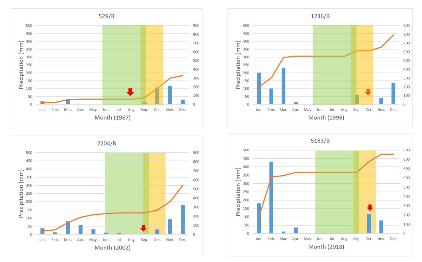
Figure 2. Monthly rainfall corresponding to the localities and year of sampling of the four accessions analyzed. Orange lines characterize accumulated rainfall over a year. The green and orange squares represent the flowering and fruiting periods of the Isoplexis isabelliana , respectively. The red arrow indicates the sampling date.

Germination ranged from 0% (2204/B) to 89% (529/B) of germination after 30 days (Figure 3). In addition, accession 529/B (the oldest accession analyzed) showed the lowest mean germination time (10.82 days) and the lowest T_{50} value (10.35 days), as well as the highest germination speed (GS) of the three accessions of I. isabelliana germinated. However, the ANOVA analysis and the multiple range test did not show significant differences between these germinated accessions. Five days after seed germination, when the cotyledons, hypocotyl and radicle were visible, the seedlings were cultivated in a substrate with peat moss, vermiculite and coconut coir (5:1:1). After ten months in the greenhouse, the percentage of viable seedlings ranged from 37.97% (1236/B) to 59.21% (5183/B) (Table 3).